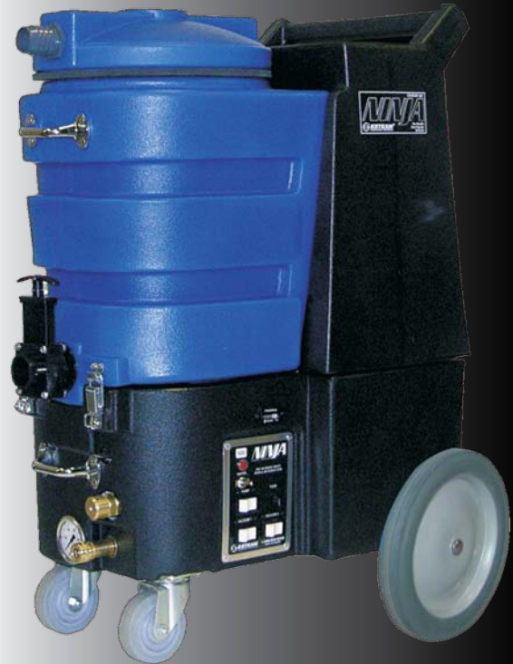
12" Wheel Lift Kit Option (205-105)