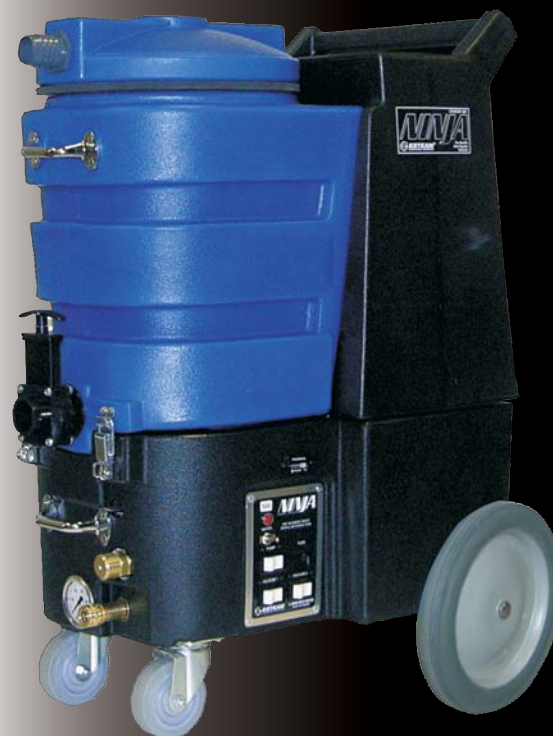
10" Wheel Lift Kit Option (205-105)